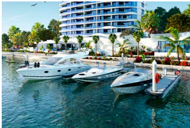
Marina Berths available for sale with apartment.