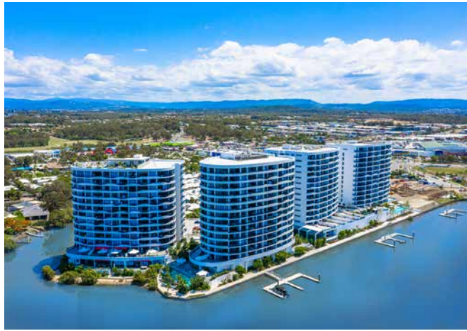
Actual photo of WaterPoint Residences I, II, III & IV